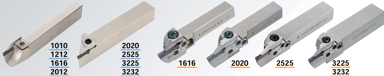
Mono block type

Corresponding blades to a variety of modular holders with different shank sizes